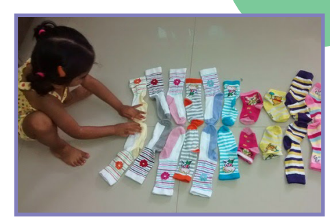
Sort socks together—talk about size, color and patterns.

Where is Thumbkin? Where is Thumbkin? (Hide hands behind back) Here I am! Here I am! (Show left thumb, then right thumb) How are you today, sir? (Wiggle left thumb) Very well, I thank you. (Wiggle right thumb) Run away, run away. (Hide left hand behind back, then right hand)