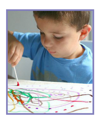
Paint with q-tips!

Pease porridge hot, pease porridge cold, Pease porridge in the pot, nine days old. Some like it hot, some like it cold, Some like it in the pot, nine days old.