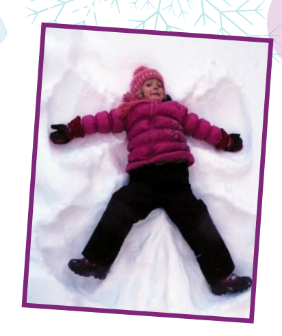
Go outside and make a snow angel!

Dance like snowflakes, Dance like snowflakes, In the air, In the air. Whirling, twirling, snowflakes, Whirling, twirling, snowflakes, Here and there, Here and there.