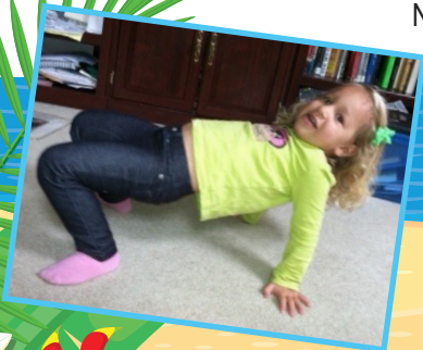
Crab walk across the living room or yard!

Oh, yes, I know the muffin man, The muffin man, the muffin man, Oh, yes, I know the muffin man, That lives on Drury Lane.