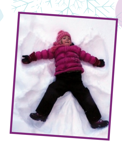
Go outside and make a snow angel!

Dance like snowflakes, Dance like snowflakes, In the air, In the air. Whirling, twirling, snowflakes, Whirling, twirling, snowflakes, Here and there, Here and there.