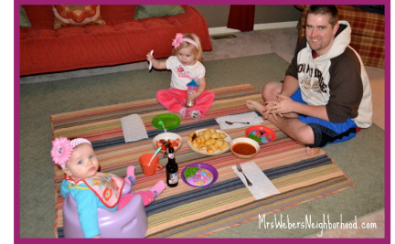
Have an indoor picnic on the living room floor!

Your Library has many resources to help you talk, sing, read, write and play with your child. Visit us soon!